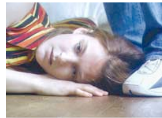
Best Narrative: “Dress Up” (Click for larger version)