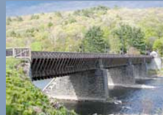
Best MusicalWork: "Roebling Resonance" (Click for larger version)

Problems? Comments? Contact the Webmaster .