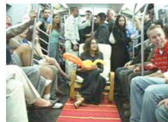
Best Experimental: “The Subway Show” (Click for larger version)