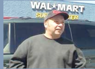
Best Student: "Wal-Mart Comes to Town" (Click for larger version)

For more information on DIGit events, or to purchase a pass, call 845/252-7576.