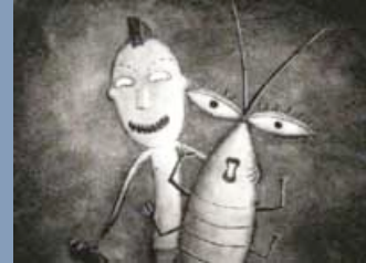
Best Animation: "Little Strong" (Click for larger version)