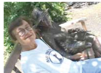
Best Documentary: “Don’t Box Me In” (Click for larger version)